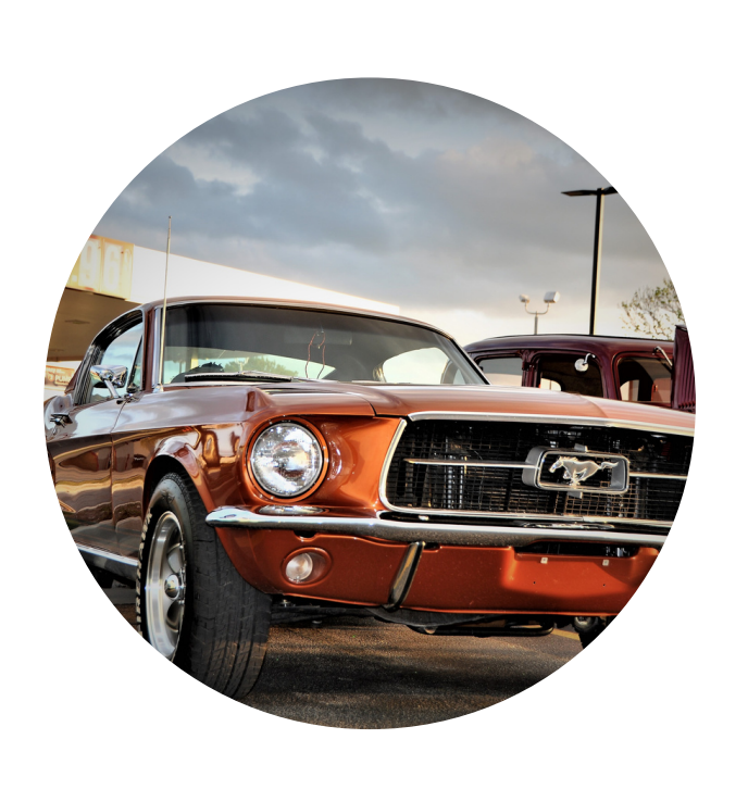
Remove cars from driveway