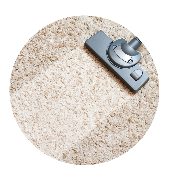
Clean carpets & hardwoods