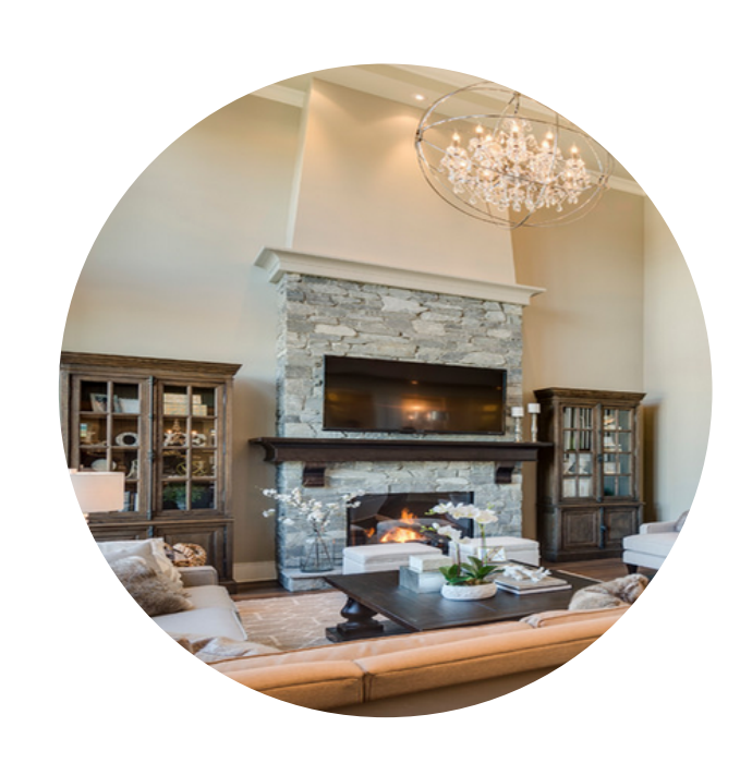
Staging (professionally or with own things)