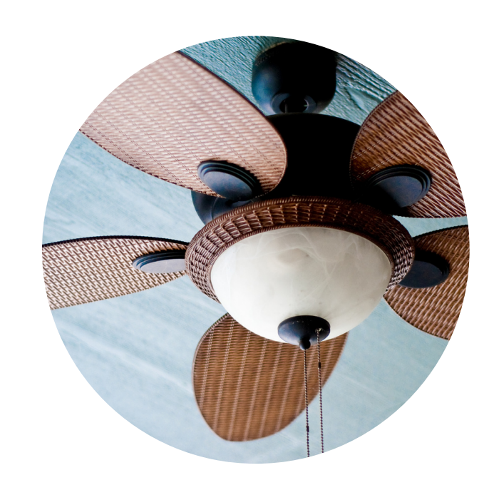
Dust tops of fans