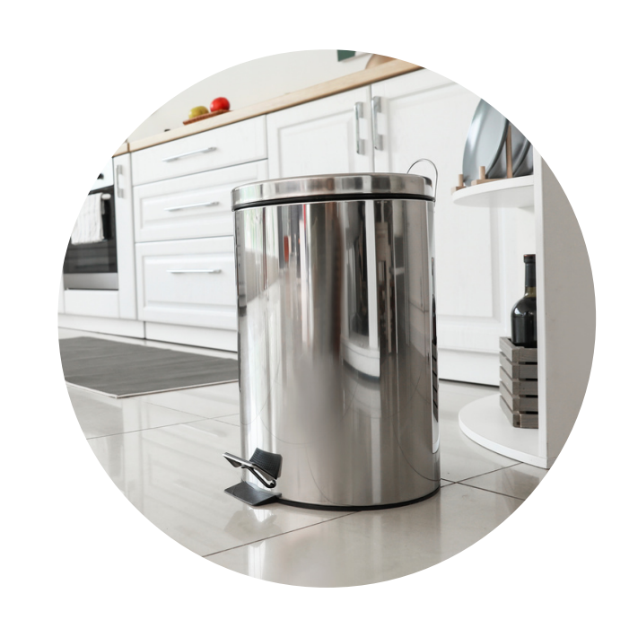
Hide all trash cans