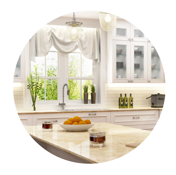
Clean stove top, counter tops, sink, put away sponge and all dish, etc.