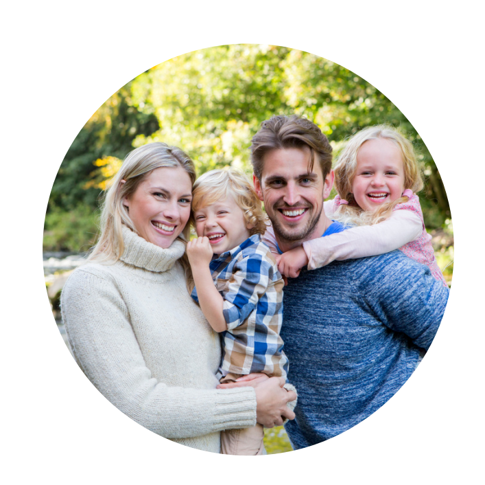
Put away family photos / personal items (if possible)