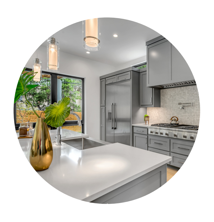
Clean & clear kitchen remove items off counters