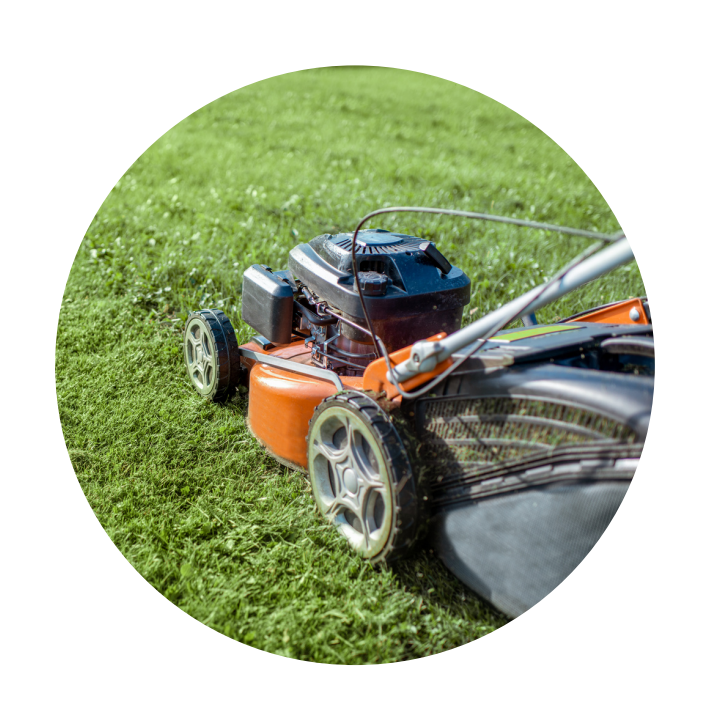
Cut grass, trim bushes, pick up leaves, hoses, etc.