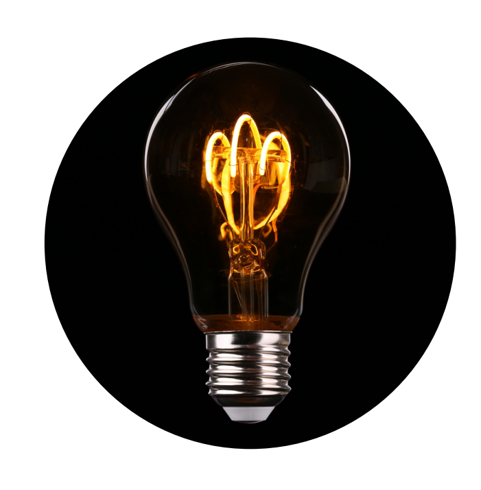
Replace bad bulbs