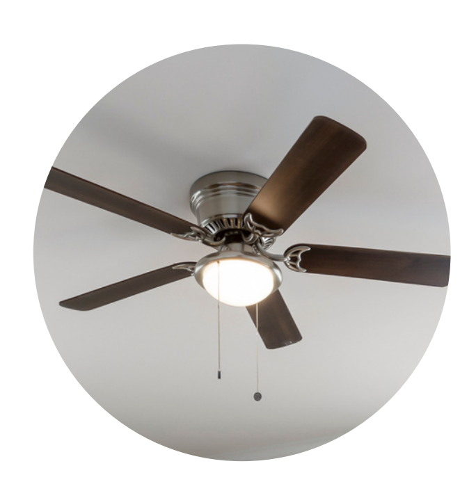
Turn off all fans