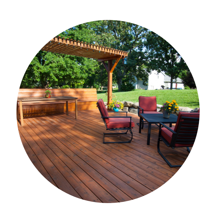
Sweep deck, patio,and driveway