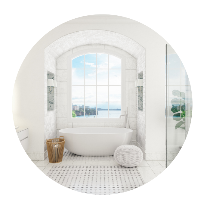
Clean & clear bathroom, sinks, tubs, and showers