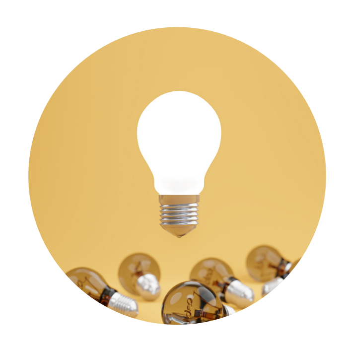
Turn on all lights