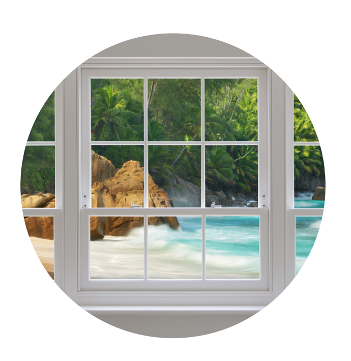
Open all blinds (pull all the way up)