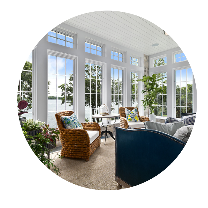
Clean windows blinds, and mirrors