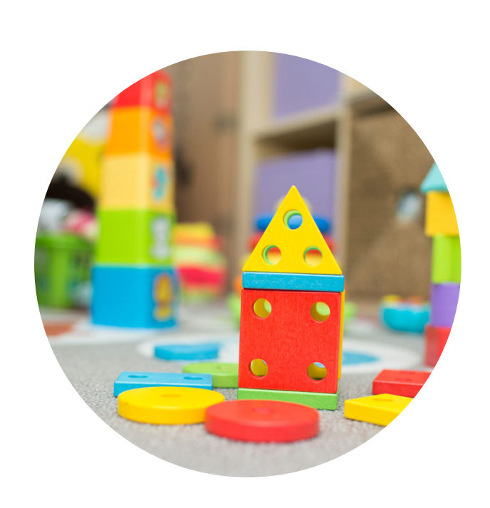
Put away kid's toys (if possible)